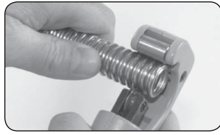
Cut the corrugated pipe at the desired place with a pipe cutter.