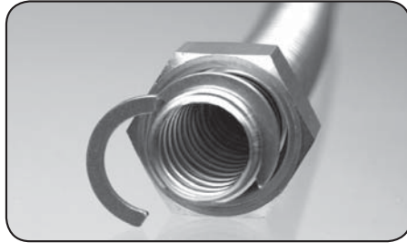
Put the union nut onto the corrugated pipe, insert the lock ring in the first trough and push together.