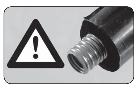
Check the cut pipe and remove any possible burrs.