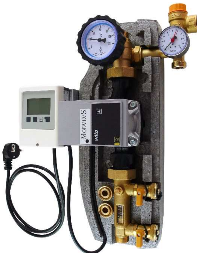
WILO Yonos Para pump connection